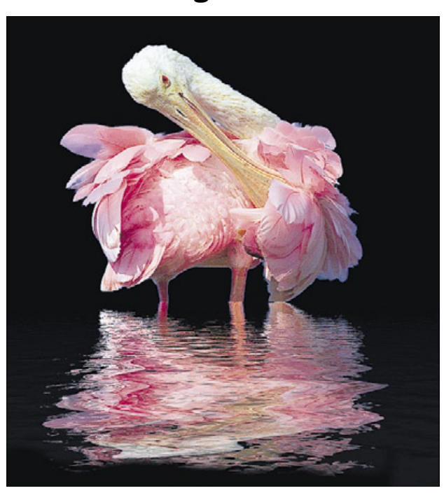
Spoonbill Reflection