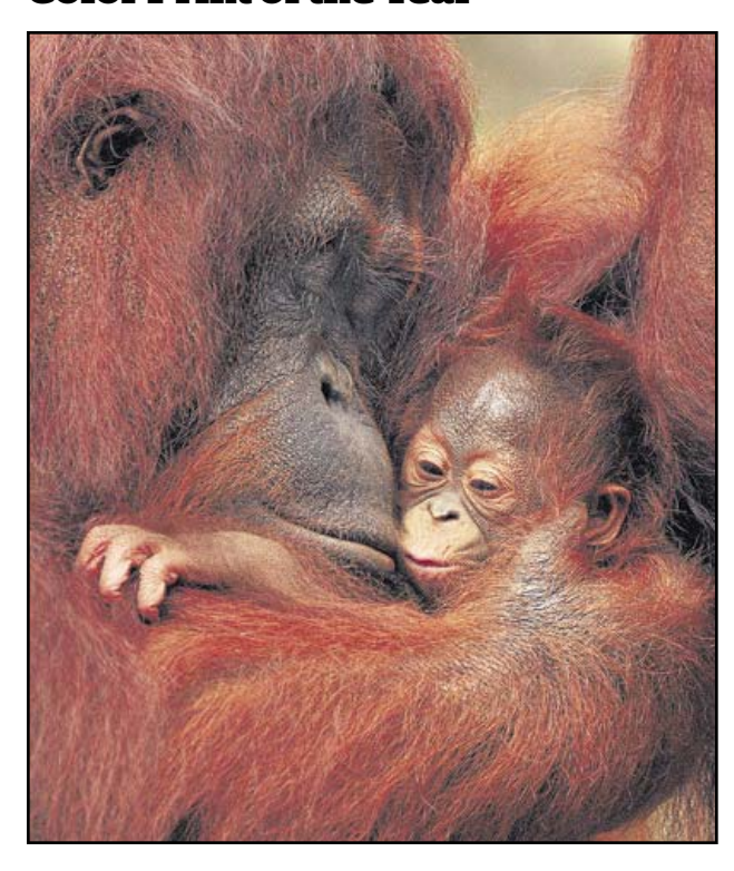
Mother and Baby