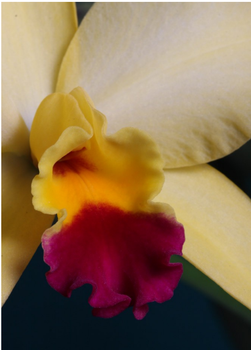
Auto White Balance